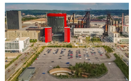
Place Des Bassins

Future years will see a strong increase in the construction of offices in Belval with the construction of the new urban quarter, Central Square. The first step of the architecture competition for the pedestrian square of this quarter (Place des Bassins) took place this March.