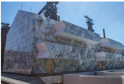
Belval University Library

Belval University Library will open its doors in September 2018 and will provide around 20,000 square metres of space for study and knowledge in a building with very distinctive architecture using the steel frame of the former Hall known as the "Möllerei".