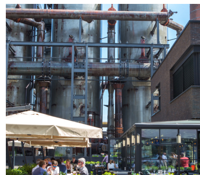
Blast furnace terrace

This new quarter with 80,000 square metres of development land will have a family orientation, offering blocks of flats but also plots enabling the construction of single-family homes.